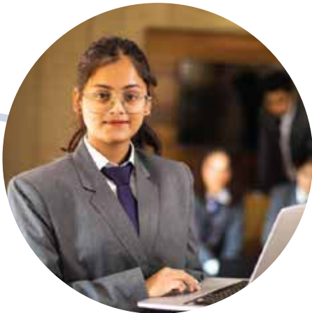
BBA in Digital Marketing