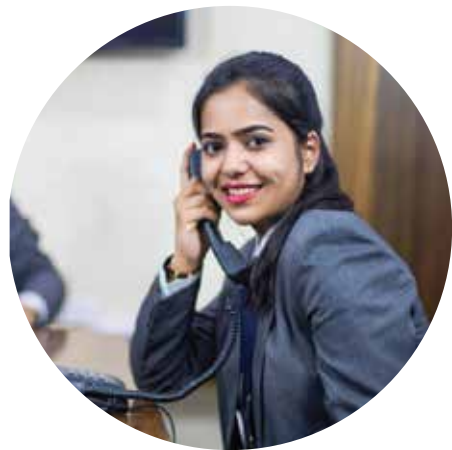
BBA (Hospital Management)