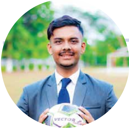
BBA (Sports Management)