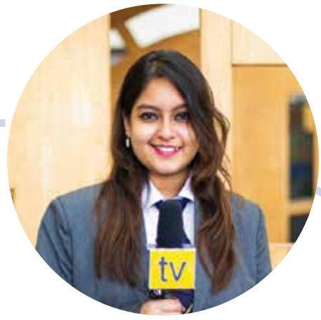
B.Sc in Media Science