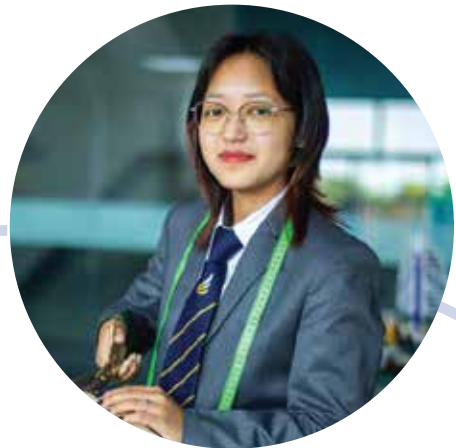
B.Sc in Fashion Design & Management