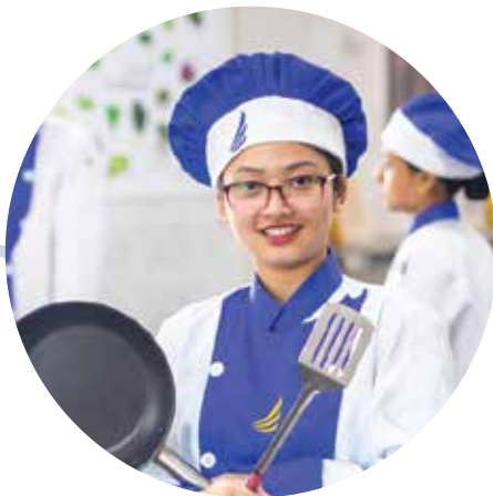
B.Sc in Hospitality and Hotel Administration (Hotel Management)