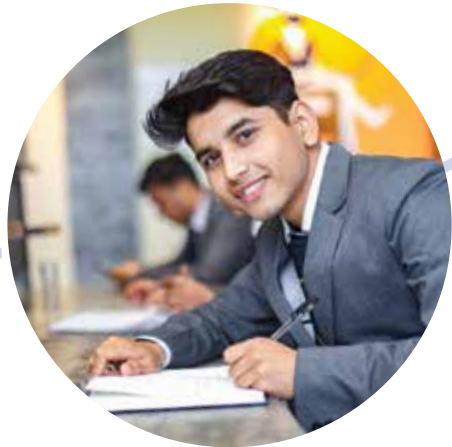
BBA (Accountancy, Taxation & Audit)