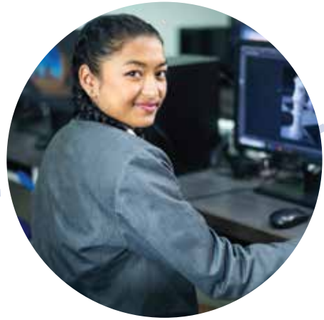
B.Sc in Multimedia, Animation and Graphics Design