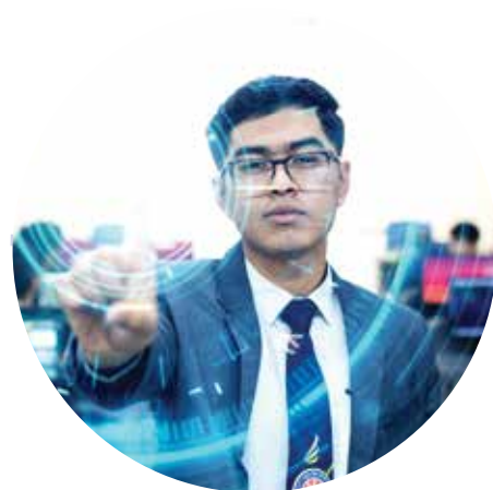
B.Sc in IT (Artificial Intelligence)