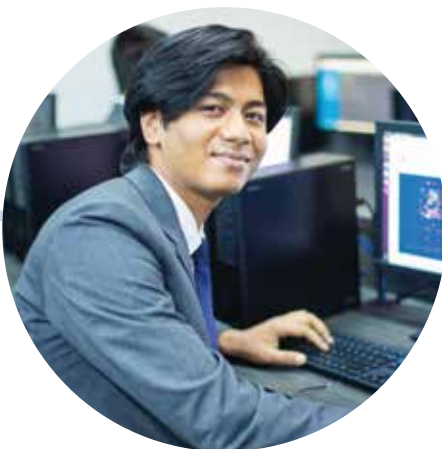
B.Sc in Data Science