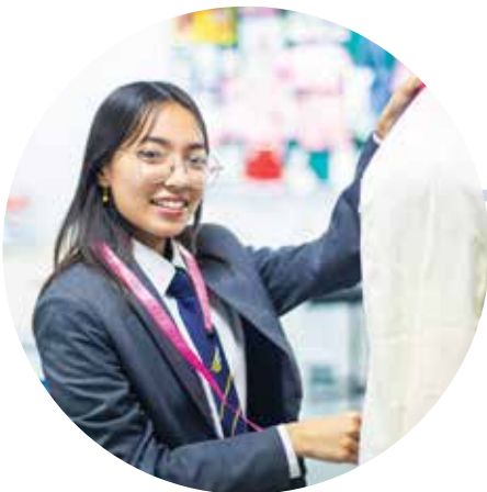
B.Sc in Fashion Design & Management