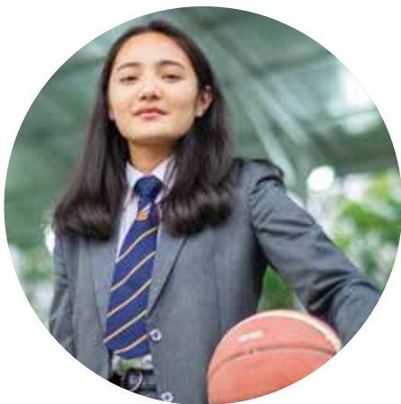
BBA (Sports Management)