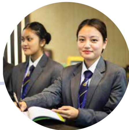
BBA (Hospital Management)