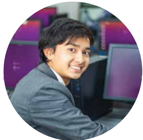
BCA (Bachelor of Computer Application)