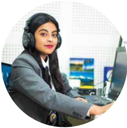
B.Sc in Media Science