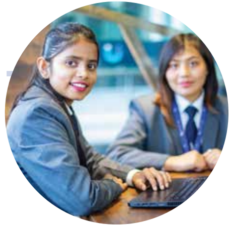
BBA (Accountancy, Taxation & Audit)