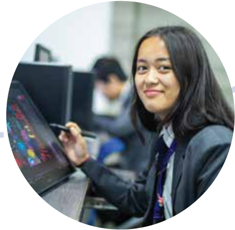
B.Sc in Multimedia, Animation and Graphics Design