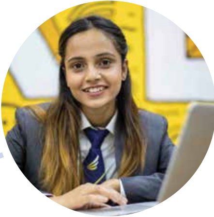
BBA in Digital Marketing