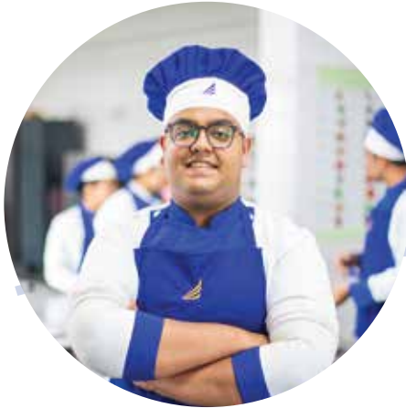
B.Sc in Hospitality and Hotel Administration (Hotel Management)