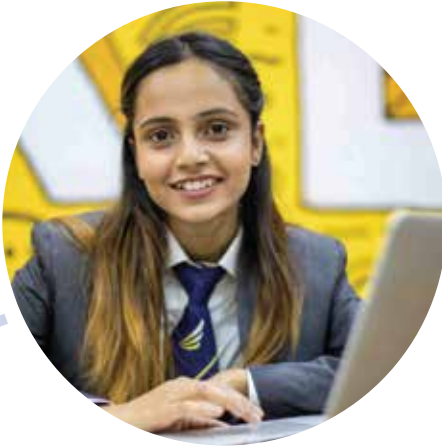
BBA in Digital Marketing