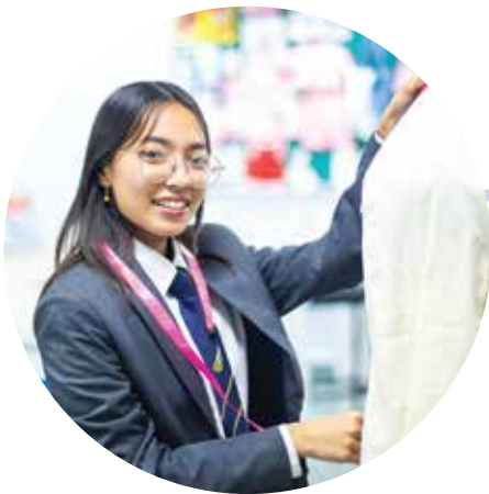
B.Sc in Fashion Design & Management