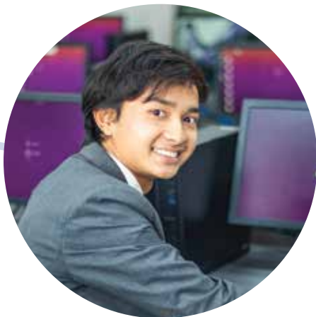
BCA (Bachelor of Computer Application)