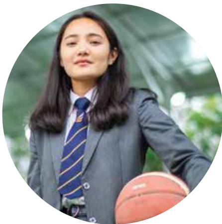
BBA (Sports Management)