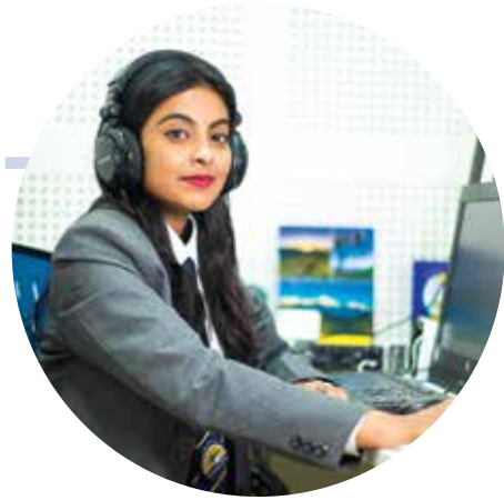
B.Sc in Media Science