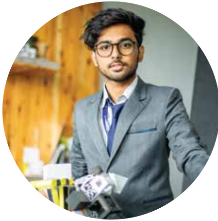
B.Sc in Interior Designing