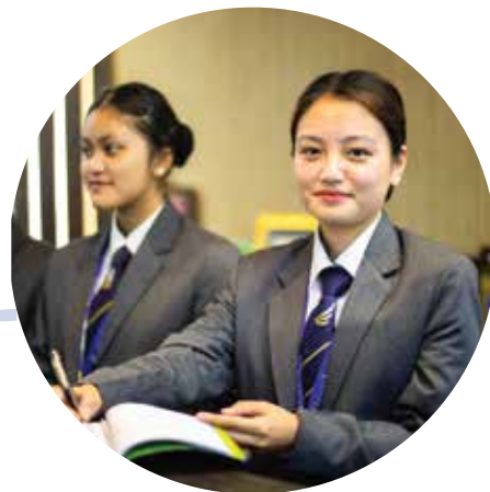
BBA (Hospital Management)