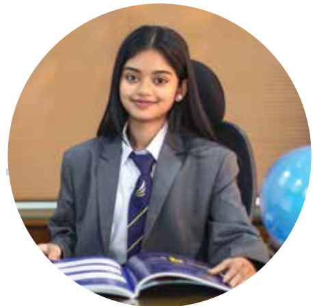
BBA BBA in Aviation Hospitality Services & Management