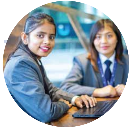
BBA (Accountancy, Taxation & Audit)