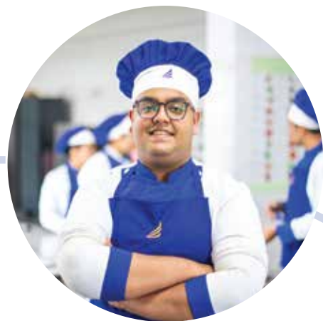
B.Sc in Hospitality and Hotel Administration (Hotel Management)