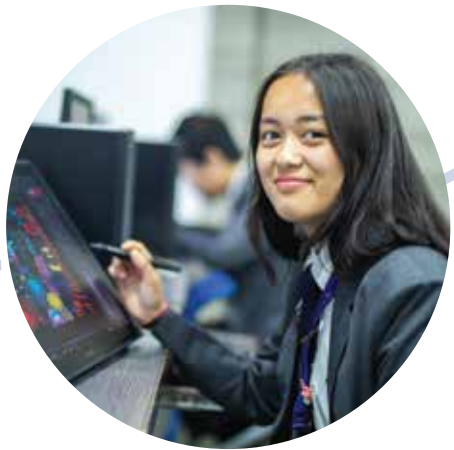
B.Sc in Multimedia, Animation and Graphics Design