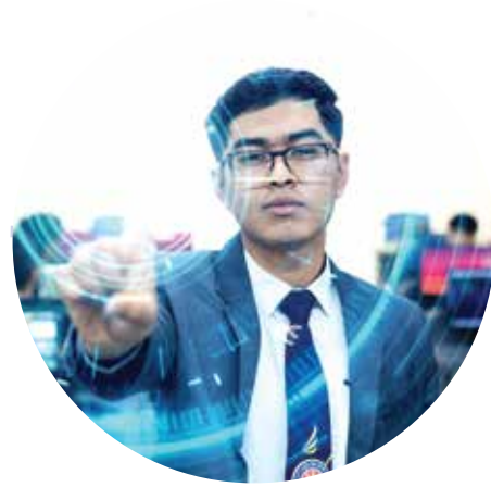
B.Sc in IT (Artificial Intelligence)