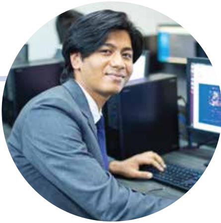
B.Sc in Data Science