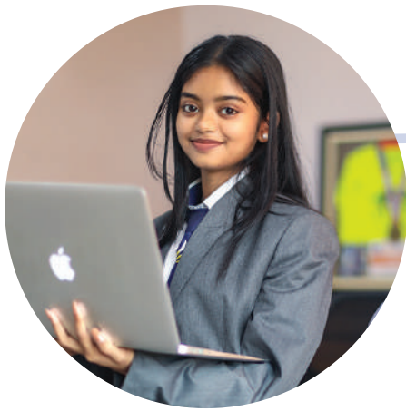
BBA (Global Business)