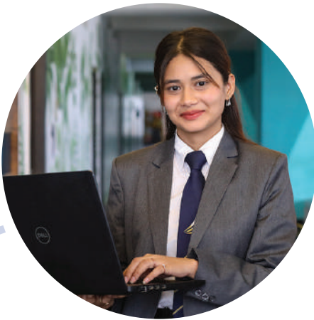
BBA in Digital Marketing