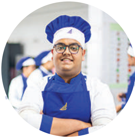
B.Sc in Hospitality and Hotel Administration (Hotel Management)