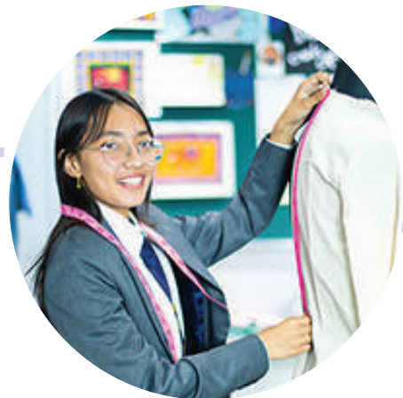
B.Sc in Fashion Design & Management