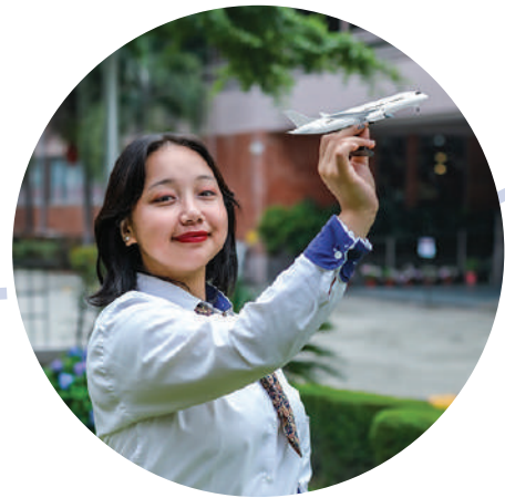
BBA in Aviation Hospitality Services & Management