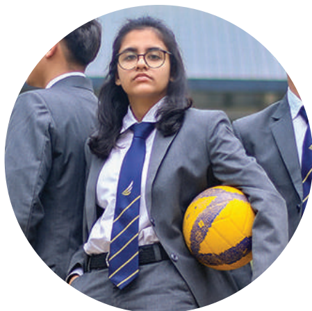
BBA (Sports Management)