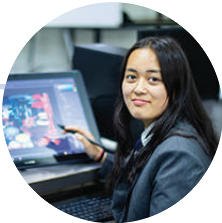
B.Sc in Multimedia, Animation and Graphics Design