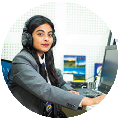
B.Sc in Media Science