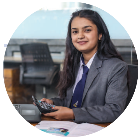
BBA (Accountancy, Taxation & Audit)