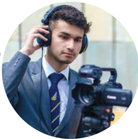
B.Sc in Media Science