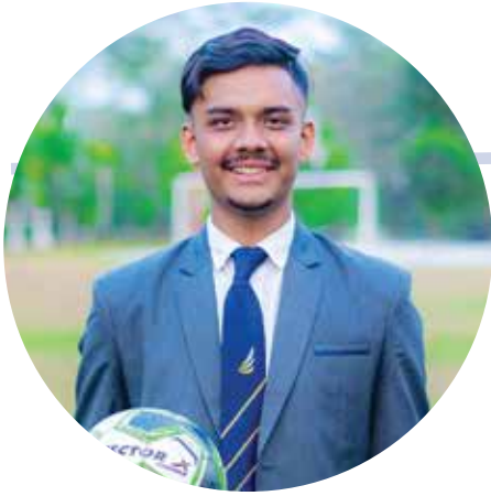
BBA (Sports Management)