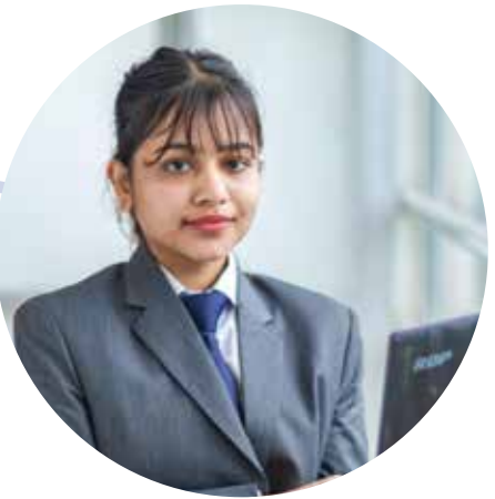
BBA in Digital Marketing