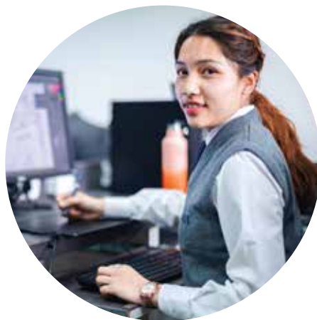
B.Sc in Multimedia, Animation and Graphic Design