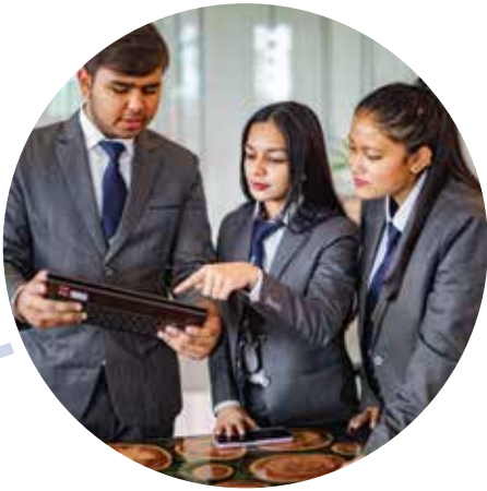
BBA (Global Business)