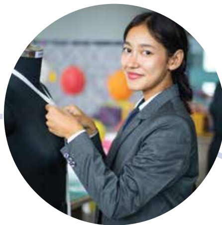
B.Sc in Fashion Design & Management