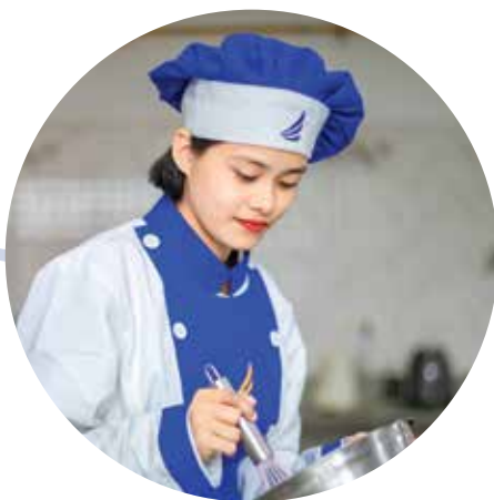
B.Sc in Hospitality and Hotel Administration (Hotel Management)