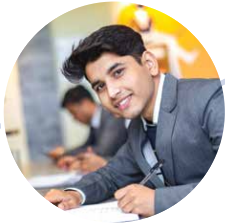
BBA (Accountancy, Taxation & Audit)