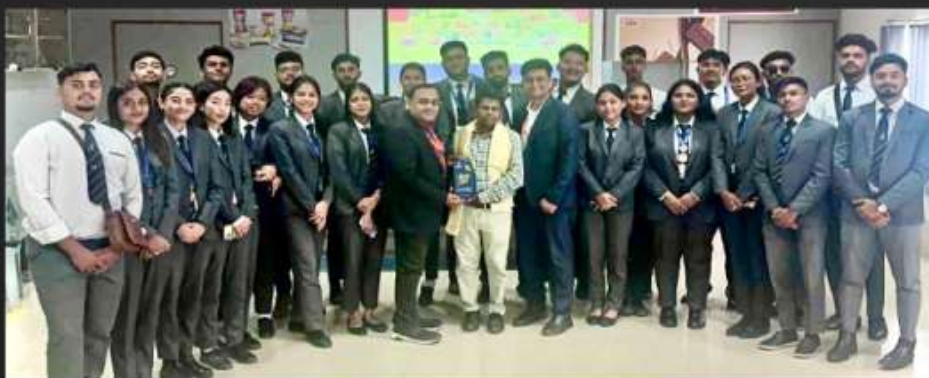
Parle Biscuits, Bhubaneswar

Go beyond the books—our BBA industrial visits give you front-row access to real business operations and industry excellence!!