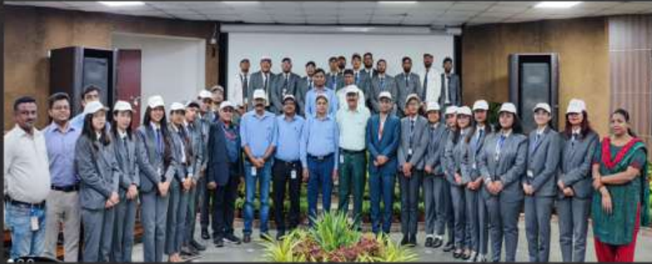
Dhamra Port, Adani Group