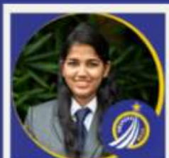
Xaviers Business School