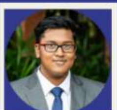
Leeds Beckett University