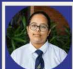
University of Liverpool