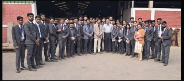
Buland Plywood, Guwahati