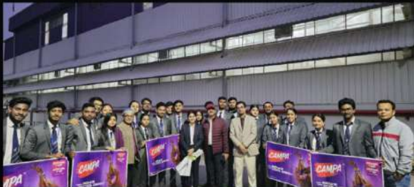
Campa Cola, Guwahati