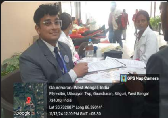
Registration desk at the blood donation event