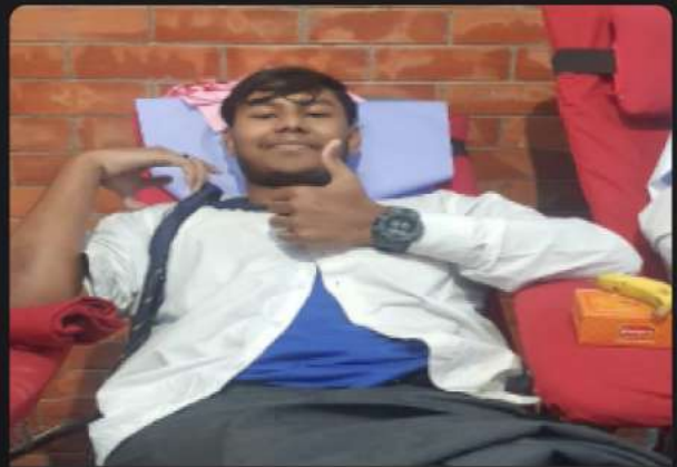
Student of Inspiria donating blood