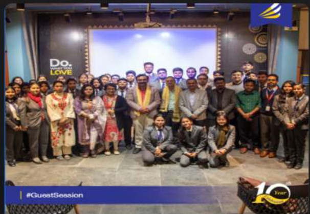
Session taken on Neuro- care by Doctors of Apollo hospital