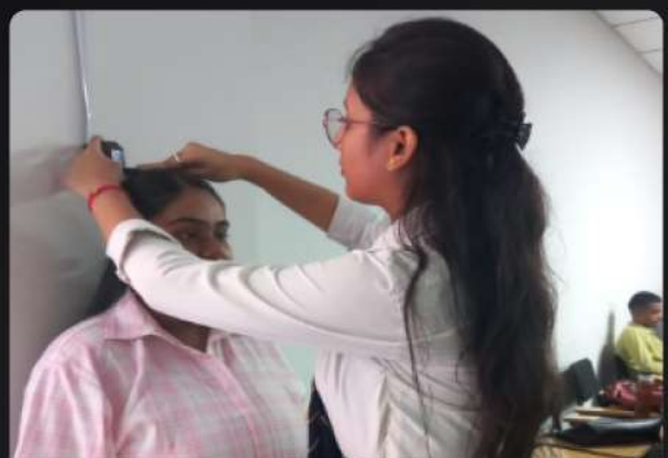
Height measurement by HM student of first year new joinee