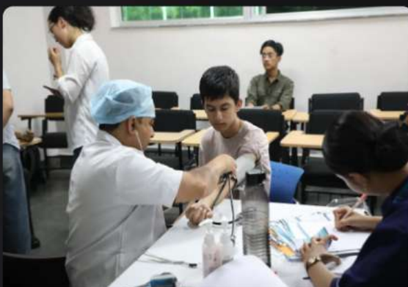
Blood pressure measurement of a new student by an employee of Thalamus Hospital