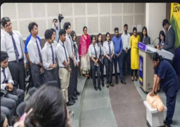
Workshop on CPR by Kins Hospitals & CII