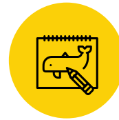
DESIGN SKETCH EXPERT