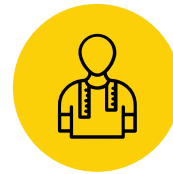
EXECUTIVE FASHION DESIGNER