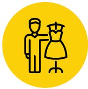
INDEPENDENT FASHION DESIGNER