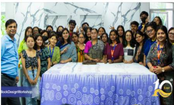
Block printing Workshop