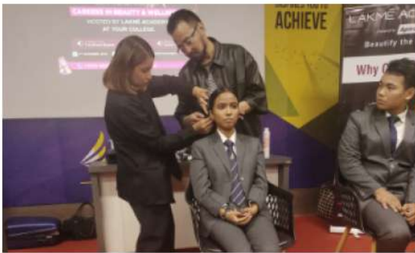
Lakme Makeup Workshop