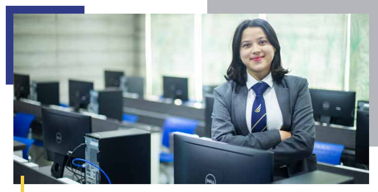
B.Sc. in Multimedia, Animation & Graphic design (BMAGD) is a four year undergraduate course in animation, multimedia & Graphic design. Featuring an innovative curriculum, this course offers specialization in 2D/3D animation and VFX leading to lucrative job prospects both in India and abroad